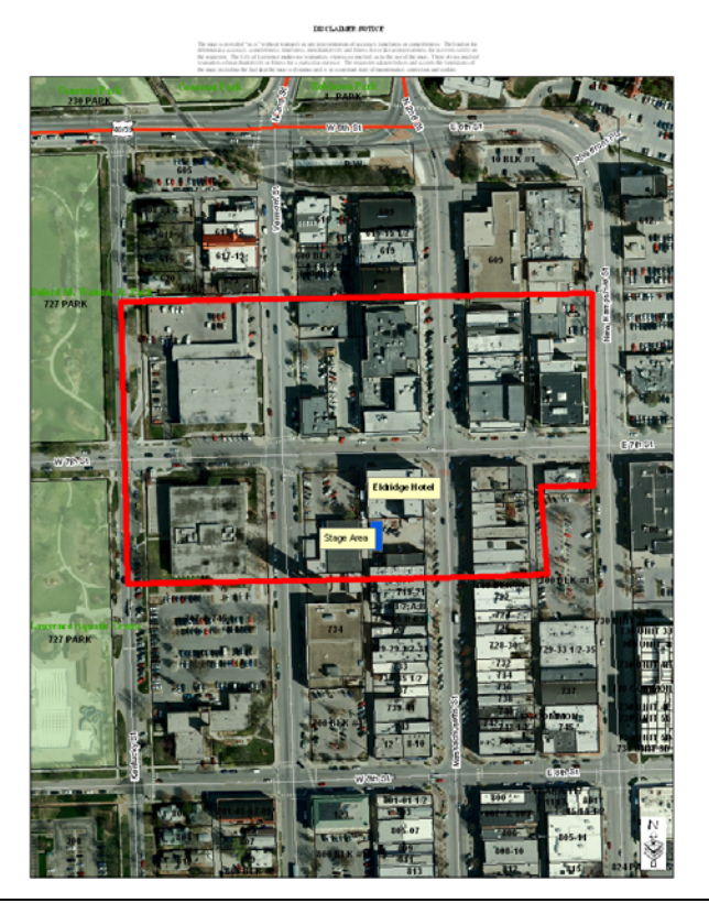
Figure 1: General Activity Area of event