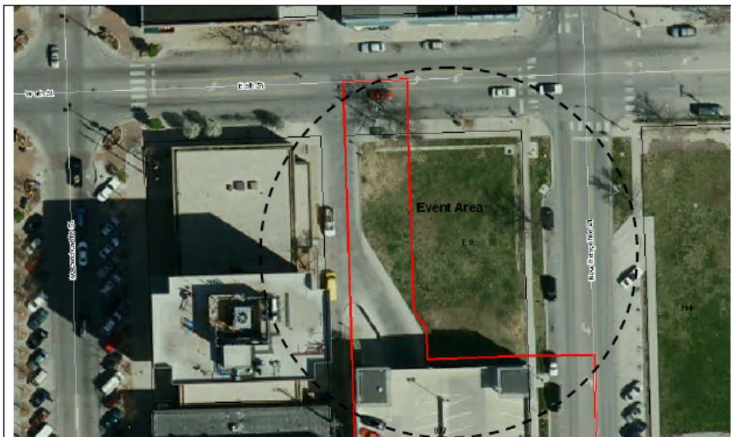
Figure 2: Event Area to occupy the green space north of the parking garage. The alley shall be blocked from vehicular use.