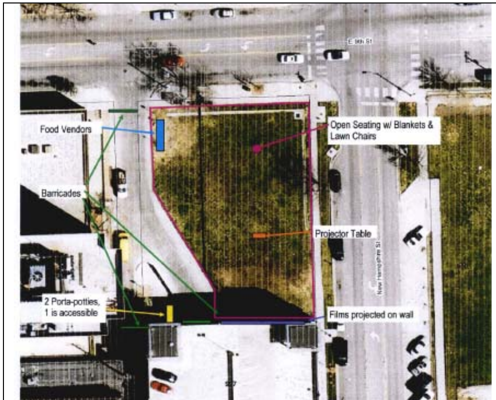
Figure 1. Proposed plan showing event layout and location of barricades. Staff recommends revised plan, Figure 3, showing the food vendor located 25' from the 9 th Street Barricade and including the barricade on the south side of the alley (on 10 th Street).