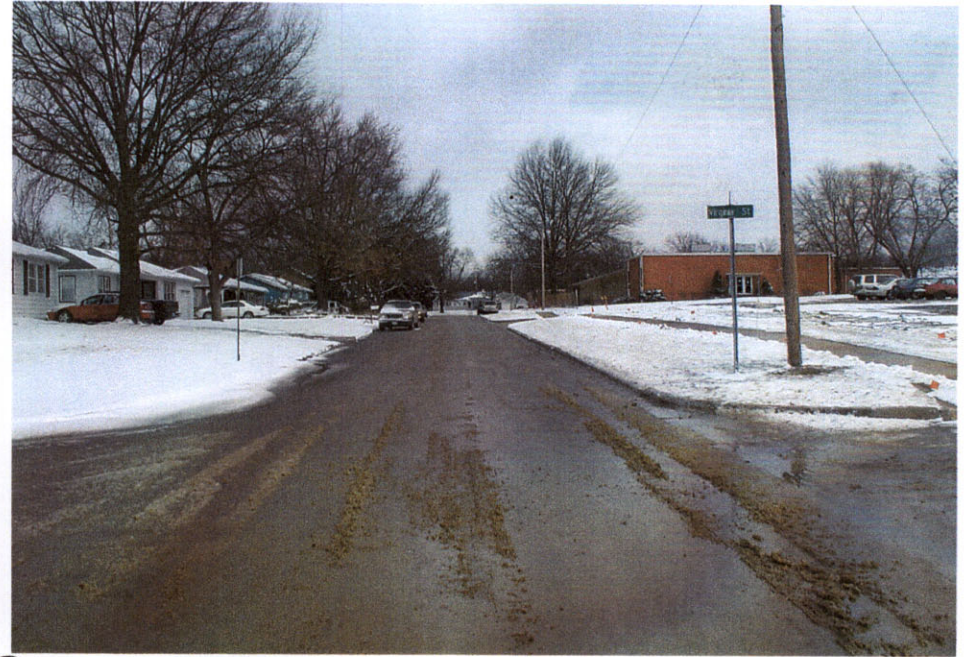
③ 600 BLOCK GREEVER TERR. - LOOKING EAST - WEEKEND