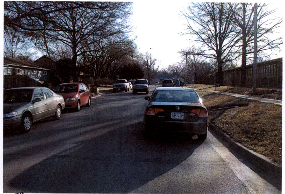
③ SAME CAR in pic. #2 - WAITED FOR VAN in Picture Below.