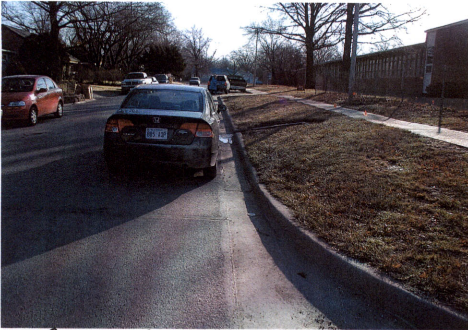
② CAR PARKED AWAY FROM CURB - NOTE CAR IN CENTER TOP