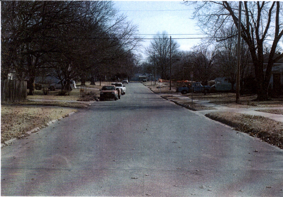
① GREEVER TERR - LOOKING EAST - 800 BLOCK - WEEKEND