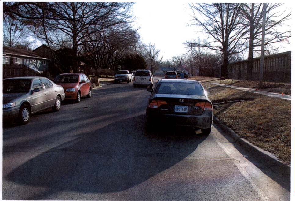
④ VAN PASSED THROUGH FIRST Before Jelp (ABOVE).