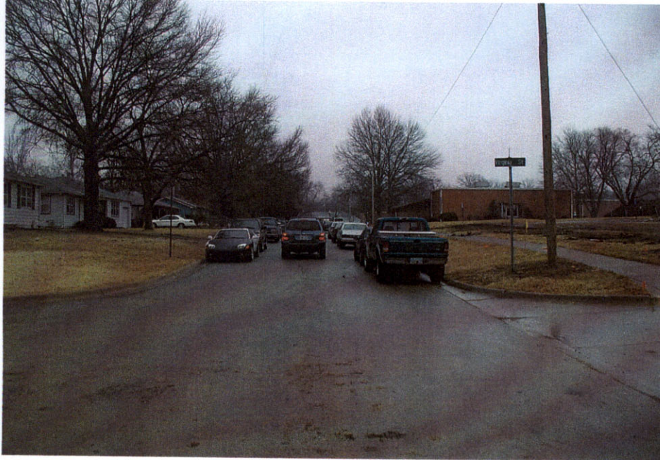
① ONE WAY TRAFFIC 6000 BLOCK