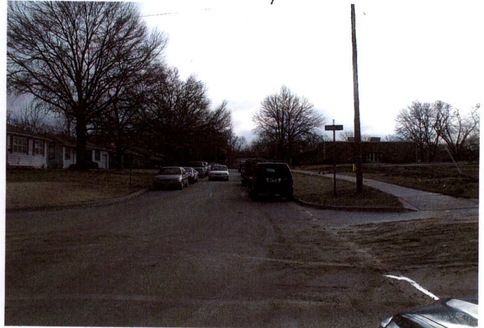
② ONE WAY TRAFFIC