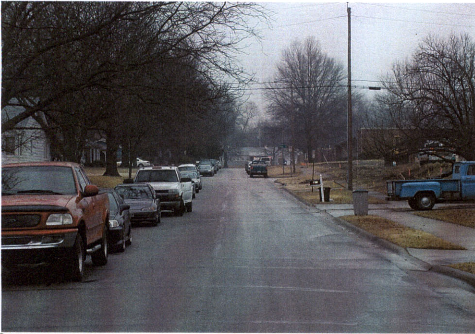
② GREEVER TERR - LOOKING EAST - WEEKDAYS - 800 BLOCK