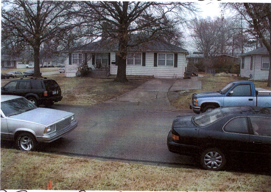
③ POTENTIAL PROBLEM BACKING OUT OF DRIVE