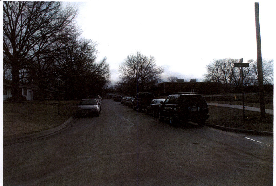
④ 600 BLOCK GREEVER TERR. - LOOKING EAST - WEEKDAYS