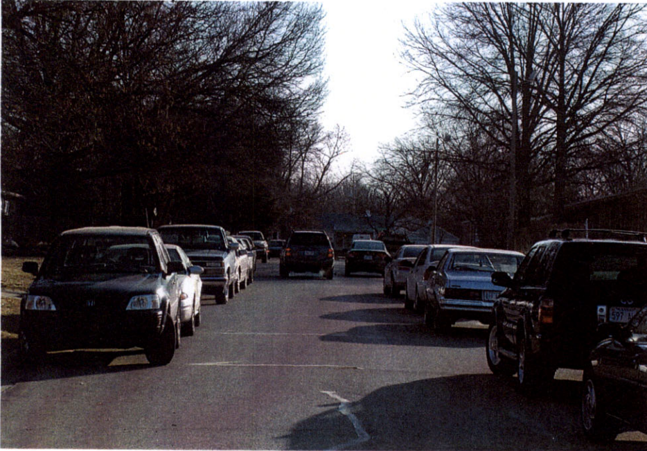
① EASTBOUND TRAFFIC - Weekday - 600 Block