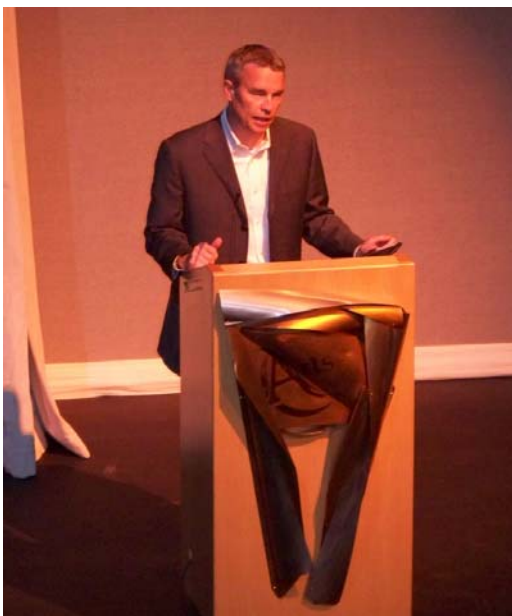
Mayor Mike Dever shares an update on the city's Climate Protection Task Force.