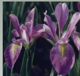
Blue Flag Iris