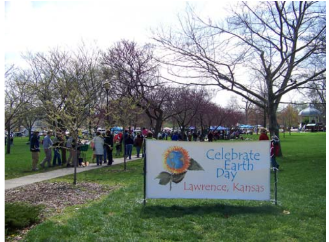
Left: The City’s environmentally friendly automobile fleet was showcased in the parade, including the new GEM (global electric motorcar). Right: Members of the community entering the Celebration at South Park after the parade.