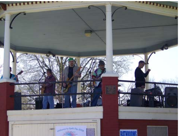
Left: Big Stack Daddy performs to a crowded South Park. Right: Gloves entertains attendees at the Celebration.