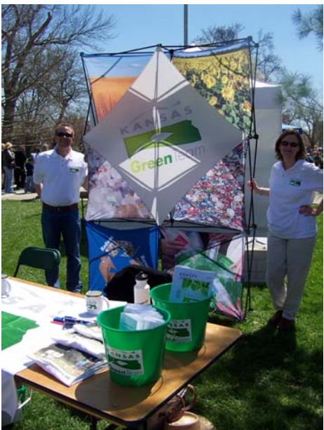
Left: Kansas Department of Health & Environment representatives display information on the Kansas Green Team Program.