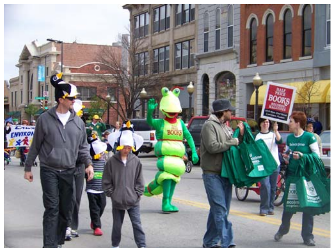
Left: Representatives from the City's Sustainability Advisory Board lead the parade carrying the Parade for the Earth banner. Right: People from Half Price Books and the Bookworm hand out reusable shopping bags in the parade.