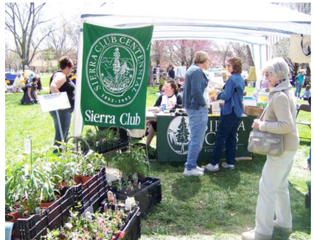
Left: Sculptures from the Van Go Mobile Arts Program made from found and recycled objects. Right: The Kansas Sierra Club displays information on land preservation and native plants by Vinland Valley Nursery.