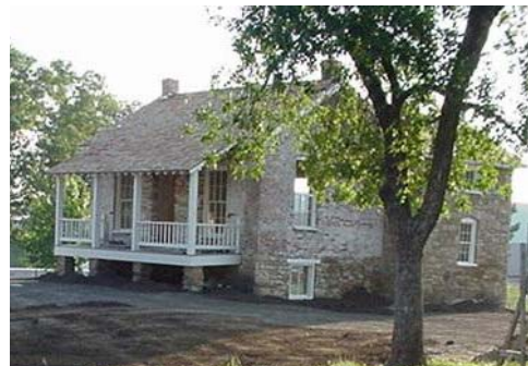
Historic Antebellum Murphy-Bromelsick House

The Lawrence and Douglas County communities wish to express our appreciation for the efforts of our Congressional delegation which recently resulted in the passage of legislation obtaining federal designation as a National Heritage Area. This designation will provide educational and cultural opportunities that capture and preserve the history of the area and focus attention on the role the region has played in the nation's struggle for freedom and opportunity for all of its people.