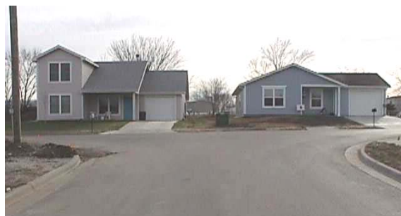
Atherton Court homes built by Tenants to Homeowners and Habitat for Humanity through funds provided by CDBG and HOME programs.

For fiscal year 2006, the City of Lawrence CDBG allocation was $816,981 and for HOME, $645,694. Although HOME funds have remained relatively steady (only 1.2% decrease since 2004), the CDBG allocation has experienced a 13.8% decrease since the 2001 allocation. The City of Lawrence uses CDBG and HOME funding for various community wide activities including a highly successful comprehensive housing rehabilitation program, first time homebuyer, emergency, energy efficiency, and weatherization programs – all for low and moderate income owner/occupants, funding of neighborhood associations in target neighborhoods, target neighborhood capital improvement projects, as well as funding for public service agencies helping the homeless and other low and moderate income persons in the community. As the City awaits the outcome of the 2007 funding allocation, we oppose efforts for any further cuts to these allocations.