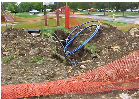
Lawrence must be able to regulate utilities that use public right-of-way.

Recent proposed legislation would strip the ability of local communities to regulate the use of their local right-of-way by telecommunications companies. We urge our federal legislators to recognize the recent changes made by the Kansas legislature on this topic removing the need for federal legislation for Kansas companies and consumers. Kansas cities must continue to receive appropriate compensation for the use of their public right-of-way and must continue to be able to regulate the use of public right-of-way.