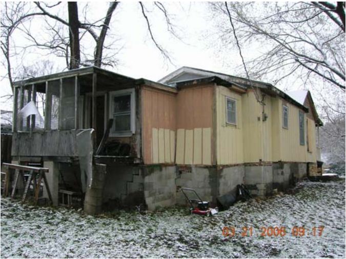
South side, view from back: