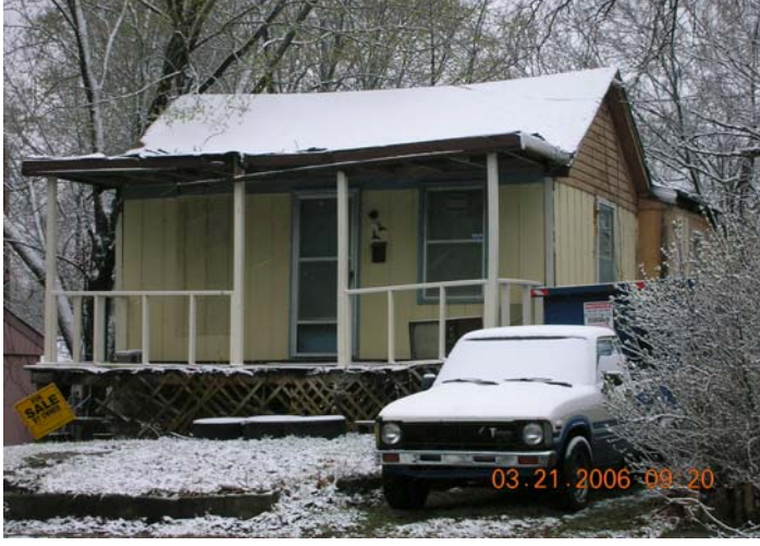
Front porch, rotted porch structure, flooring and roof: